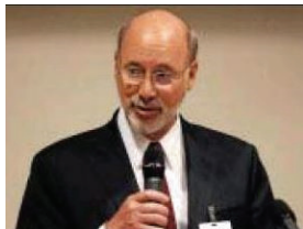
Gov. Tom Wolf, a Hill School graduate, was kickoff speaker at a recent investors' conference sponsored by The Hill School.