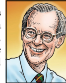
Commentary by Tom Hylton

Hobart's Run area consists of about 600 mostly residential parcels, plus Edgewood Cemetery, located around the perimeter of The Hill School