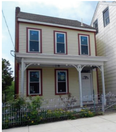
442 CHESTNUT STREET was one of the least expensive houses sold recently in Pottstown, for $27,000.