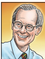
Commentary by Tom Hylton

Pottstown has about 9,300 households. We only need to attract a few hundred new “smart people” over the next decade to transform our town. Focusing on sustainability is the way.