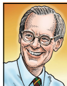
Commentary by Thomas Hylton

The plan is designed to increase our quality of life by conserving and protecting Pottstown's buildings, infrastructure, and natural resources.