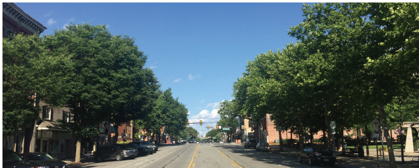
DOWNTOWN HIGH STREET — None of the trees shown above on High Street, just west of Hanover Street, existed 40 years ago. Most of the 415 trees on High Street were planted in the late 1980s.