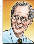
Commentary by Tom Hylton

Einstein revolutionized physics, helping to usher in the nuclear age. He paved the way for much of the fantastic technology we take for granted. But he was also respected as a philosophical free-thinker.